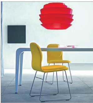
Top brands: Foscarini's room sets, above, and lighting, left, feature among the top brands on show