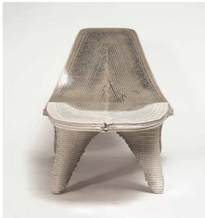
Digital Chaiselongue © Paris Tsitsos