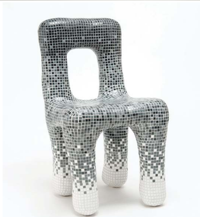
Gradient Tiles Chair