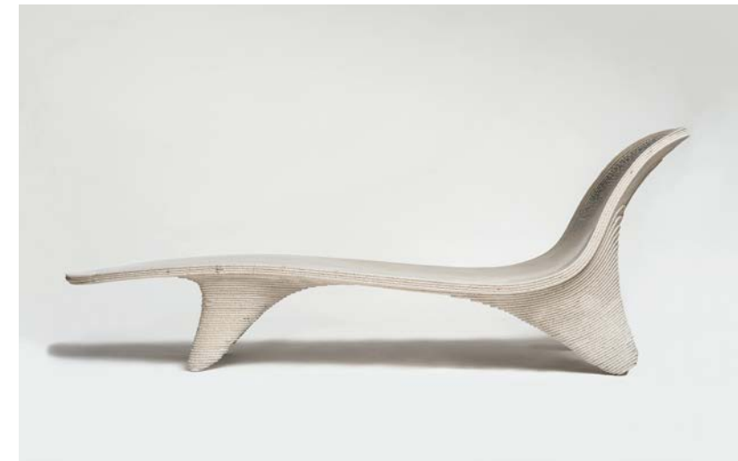
Digital Chaiselongue

Prepare to have very strong stamina for this profession, it takes a lot of effort and time to establish your own brand and design. It took me much longer than I expected in advance. ■