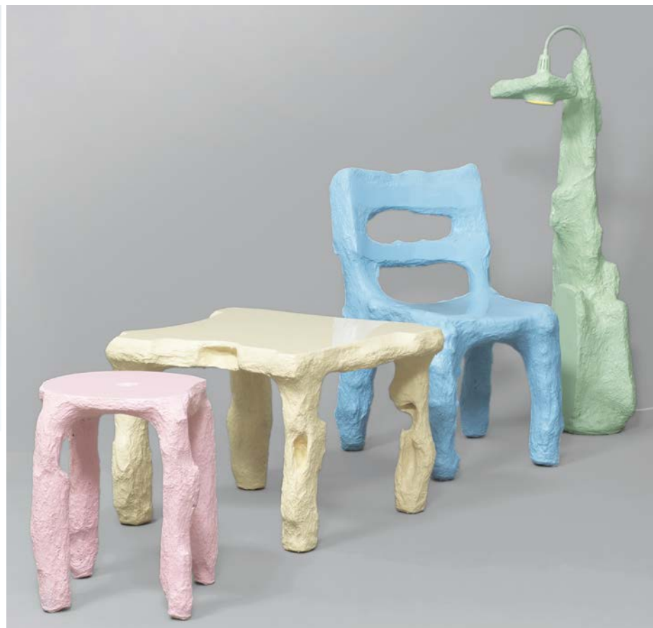
Reversed Process Furniture © Georg Molterer